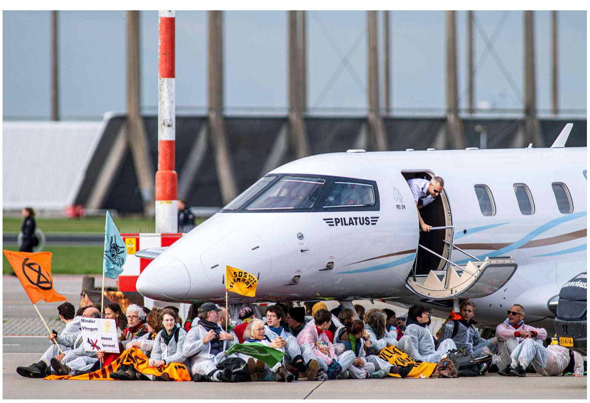
Activists ground a private jet for six and a half hours in Amsterdam.

Despite these extraordinary emissions statistics, there is hope. Following protests by Greenpeace and Extinction Rebellion,<sup>8</sup> Schiphol, the biggest airport in the Netherlands, announced it was going to ban private jets by 2026,<sup>9</sup> although this has been dismissed by the new government.