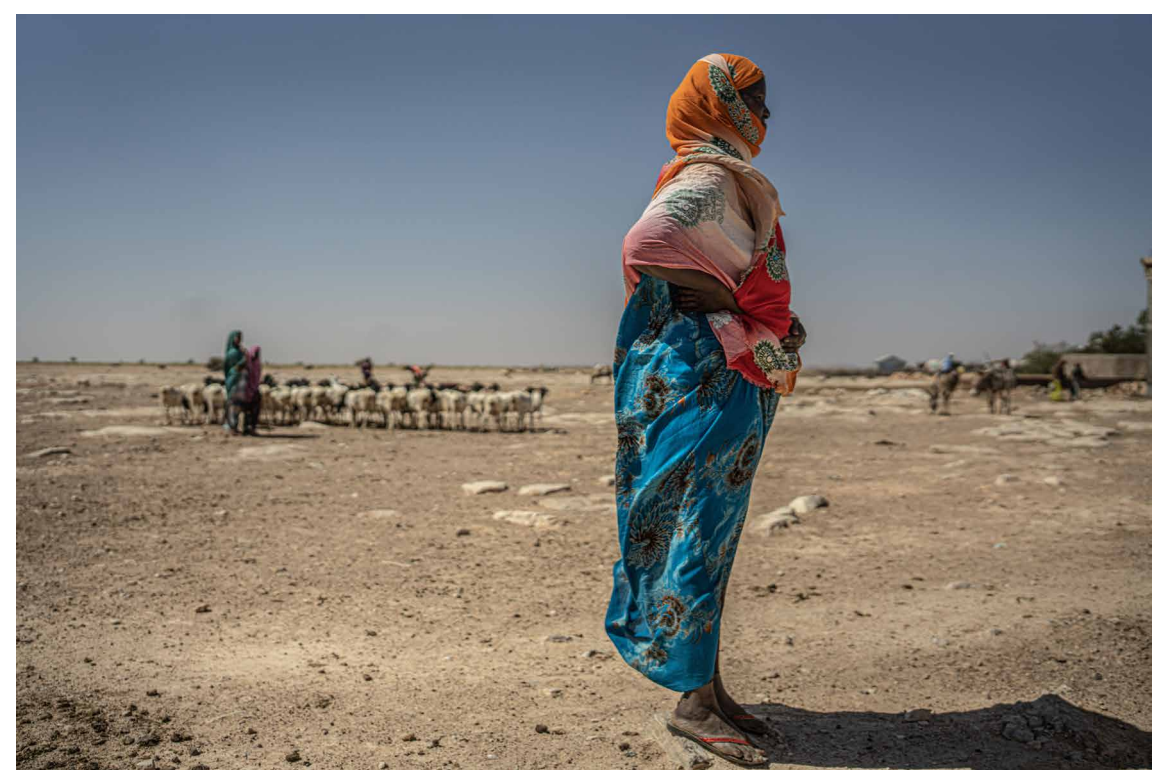
The Sanaag region of Somalia, where Oxfam has built a water supply system for people and animals.

A note: In this section, economic damages are expressed in International Dollars ($), which adjusts for Purchasing Power Parity (PPP). Taking this approach allows for a fairer comparison of climate damages since International Dollars ($) better account for differences in the cost of living between countries. Using United States dollars (US$) — as done commonly in early climate economic literature — would downplay harms caused to lower-income countries. Recently, using International Dollars has become a more accepted method in climate economics literature.