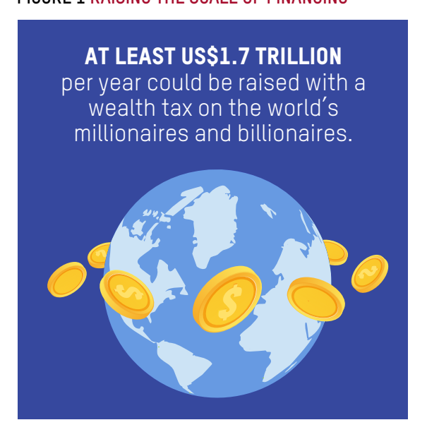
FIGURE 1 RAISING THE SCALE OF FINANCING